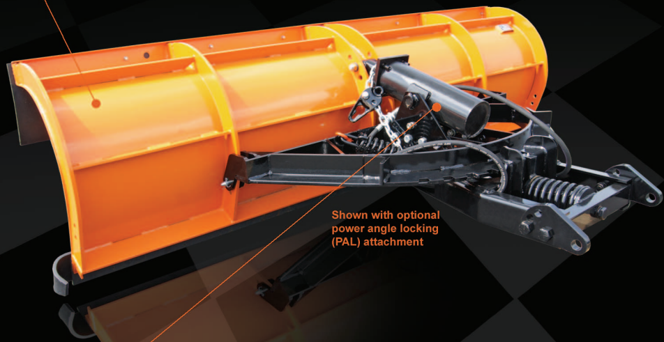
Shown with optional power angle locking (PAL) attachment

Every Good Roads plow is equipped with a standard enclosed trip mechanism.